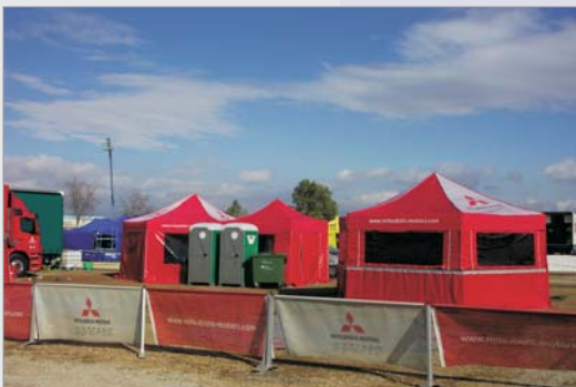
World Rallye Championship (Catalunya)