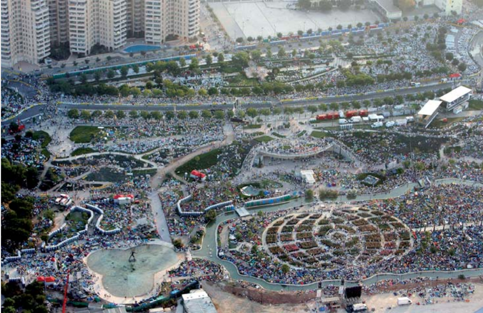
July 2006 POLY-KLYN installs 3000 portable toilets in valencia during pope BENEDICTO XVI visit