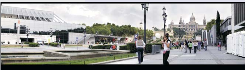
Avda. Reina M a Cristina (Barcelona)