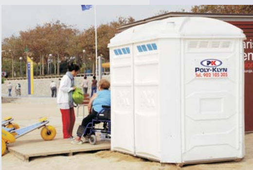
Nova Icària beach (Barcelona)