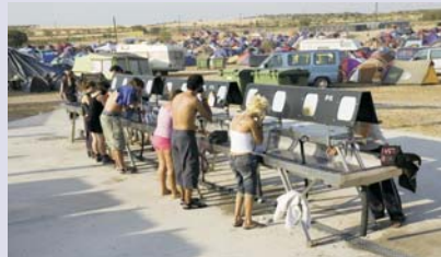
Teather on the street Fair (Tàrrega)