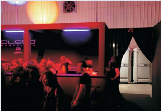
CUSTO BARCELONA PARTY (46 toilets - Barcelona)