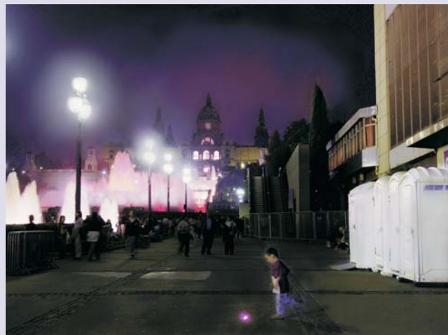
Reina M a Cristina Avenue (Barcelona)