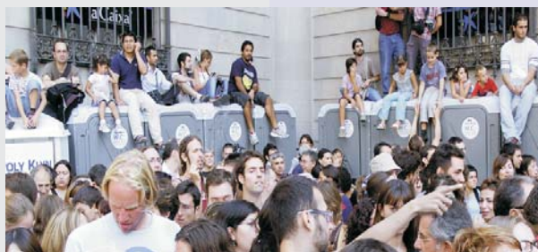
Barcelona's Mercè Holidays