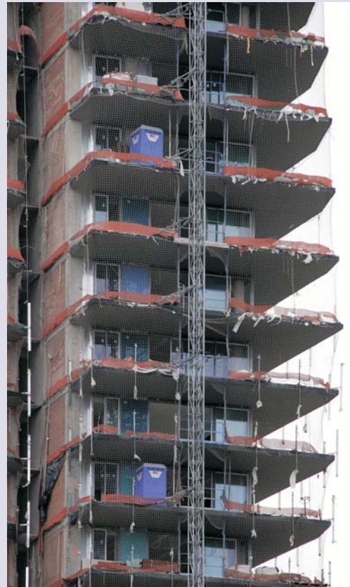
Building in construction