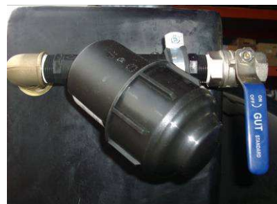
1" WATER INLET